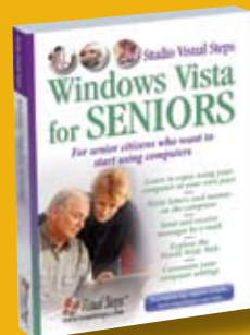
Windows Vista for Seniors ISBN 978 90 5905 274 1